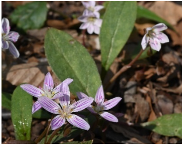
Spring beauty Claytonia caroliniana

Flowers white with pink nectar guides for bees Pollinated by spring beauty miner bee and 23 other bees Elaiosomes attract ants to carry seeds Grow from tubers, flowers early