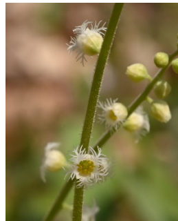
Two-leaved bishop's cap or mitrewort Mitella diphylla

Flowers with tiny, white-fringed flower petals Look like delicate snowflakes Leaves triangular coarsely toothed, 1 pair on stem Fruit 2-valved capsule looks like bishop's mitre