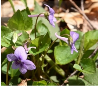
Long-spurred violet Viola rostrata

Pale purple, deep purple center Purple nectar guides, not bearded Long spur, ½ inch