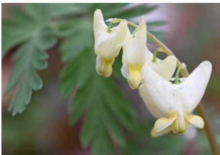
Dutchman's breeches Dicentra cucullaria

White petals, 8-12; many yellow stamens Folded leaves, flowers grow up through, cold protection Self-pollinate 3 days, then open for pollinators Leaves remain all summer Red sap Elaiosomes for ant dispersal