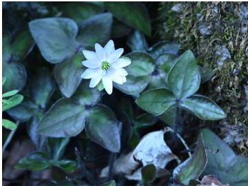
Sharp-lobed hepatica Anemone acutiloba

Flowers white with pink nectar guides for bees Pollinated by spring beauty miner bee and 23 other bees Elaiosomes attract ants to carry seeds Grow from tubers, flowers early