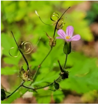
Herb-Robert Geranium robertianum

Flowers white with yellow centers Purple nectar guides, bearded