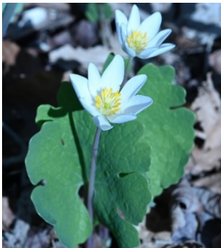
Bloodroot Sanguinaria canadensis

Green to red liver-shaped leaves, overwinter White or purple petal-like sepals, 5-12 Hairy during early growth for cold protection