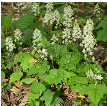
Foam flower Tiarella stolonifera

Flowers with tiny, white-fringed flower petals Look like delicate snowflakes Leaves triangular coarsely toothed, 1 pair on stem Fruit 2-valved capsule looks like bishop's mitre