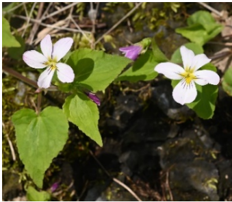
Canada violet Viola canadensis

Pale purple, deep purple center Purple nectar guides, not bearded Long spur, ½ inch